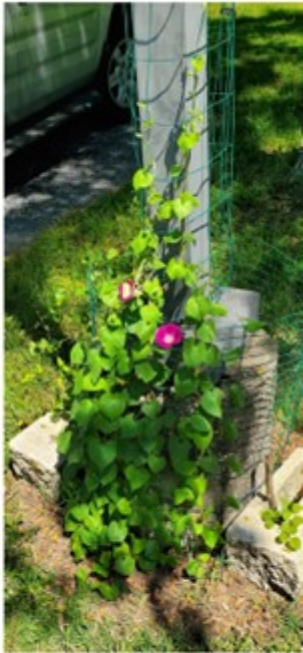
Above: New pillar: morning glory & Fall-blooming Clematis