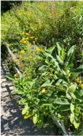
Above: Asclepias milkweed pods emerge (center right) to feed milkweed larvae!