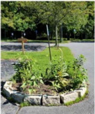
Above: A new flower bed taking shape in the parking lot! Sunchokes, Mullein, Yarrow, coneflowers