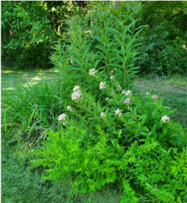
Above: Our original 2009 Rain Garden keeps blooming, with Eupatorium Boneset and Ironweed (dark purple) and American beautyberry, just starting to bloom